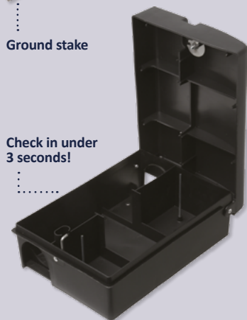
Check in under 3 seconds!

The Station can either be fixed direct to the floor through holes in the base, secured direct to a wall using a fixing bracket or secured with a ground stake.