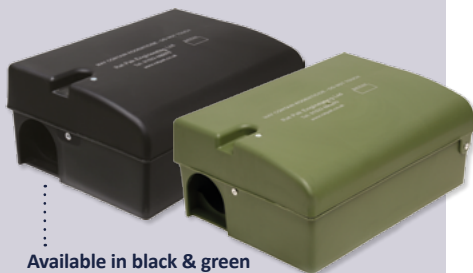
Available in black & green